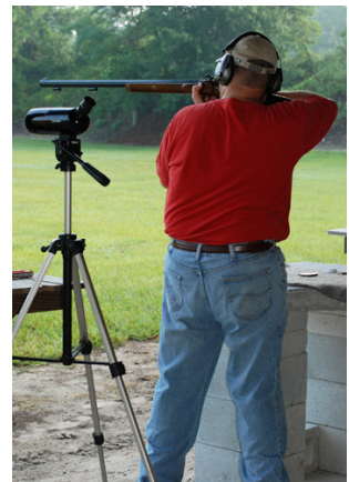
Expect a casual match with plenty of fire power, lots of smoke, and ribbon awards