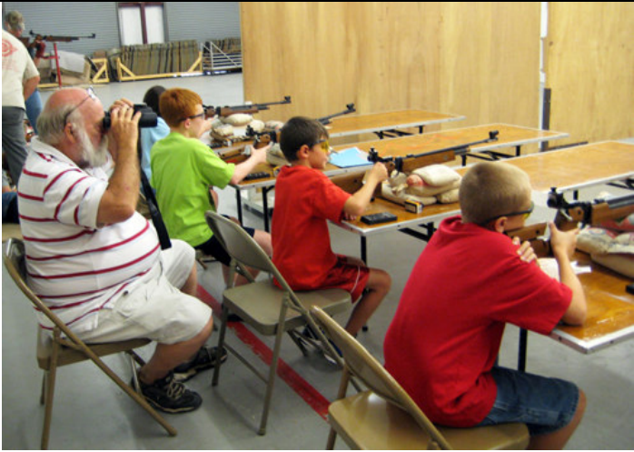
Parental attendance is encouraged.