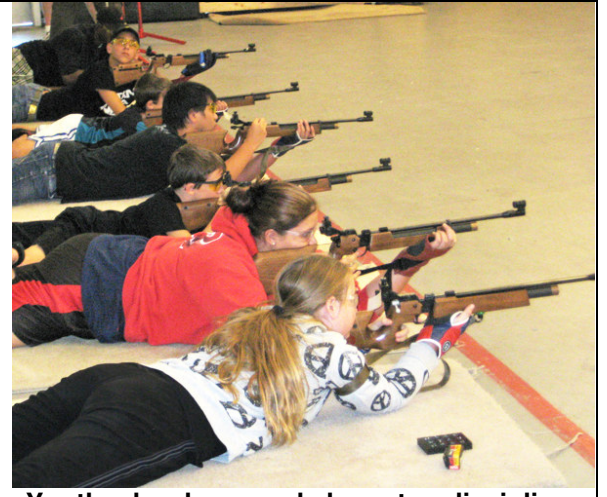
Youths develop moral character, discipline and a strong sense of self confidence.