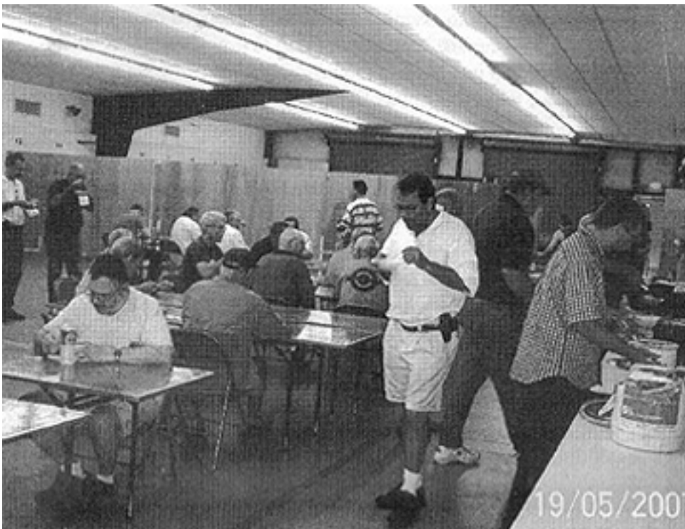
Club members enjoy the pots of chili after the winners were selected.