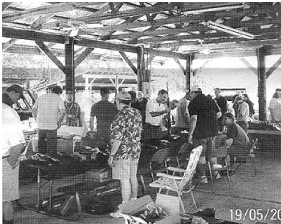
Bargains and "treasures" are examined at the Club's swap meet.