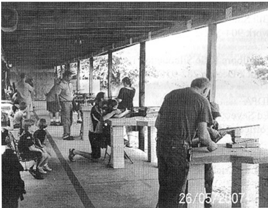
One on one instruction from the firearms coaches to the scouts.